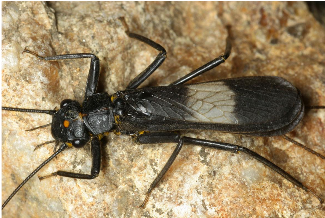
Fig. 1. Habitus of Megaperlodes tiunovi Teslenko 2015 from South Korea.

Gangwon Province of South Korea, and present a map on the distribution of the genus.